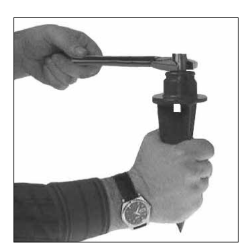
1. Tighten coupling onto mounting device*.

Make certain the electrical supply is OFF before starting fixture installation.