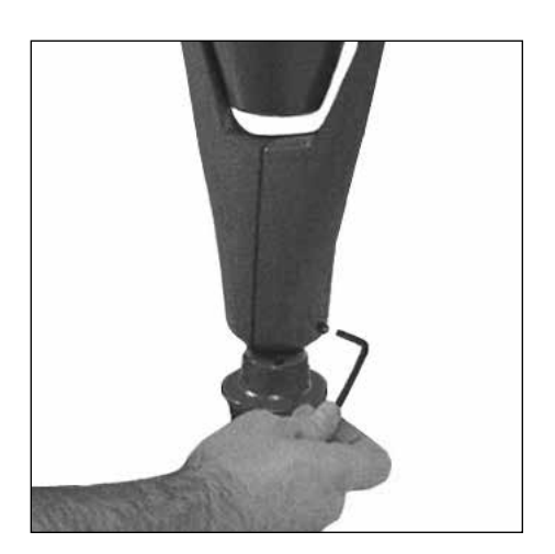
3. Loosen setscrew, adjust fixture rotation, and tighten setscrew.

IMPORTANT: Do not overload the transformer by installing higher wattage lamps than planned. Remember, the total wattage of all lamps connected to one transformer must not exceed the capacity of that transformer.